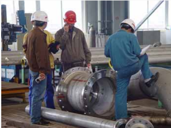
Factory Construction and Running Service