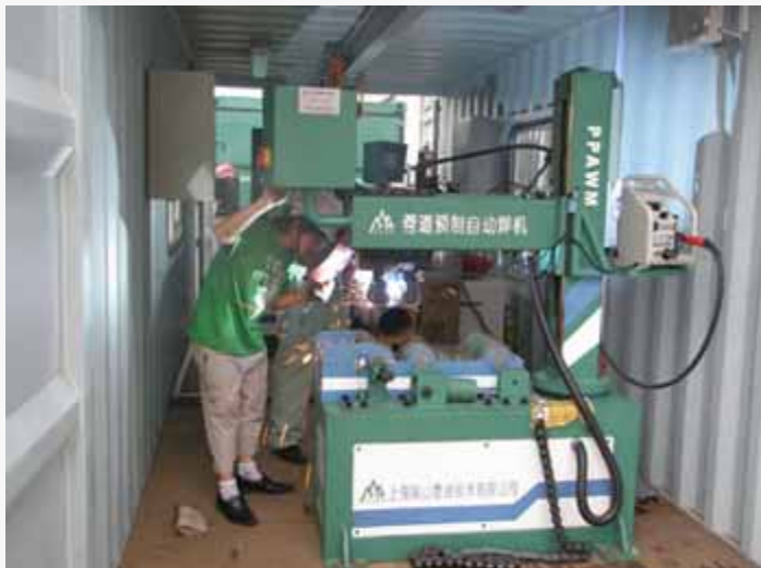
Factory Construction and Running Service